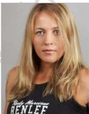
Photo: Natalia Smirnova of Russia, the new WBF Womens Intercontinental Lightweight Champion.

Natalia Smirnova of Russia is the new World Boxing Federation Womens Intercontinental Lightweight